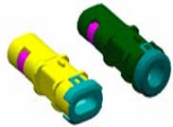
MAK12 Sealed Connectors for Fusebox